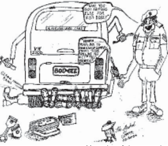
Memories of days gone by

The Trooper cannot be named for operational security reasons.