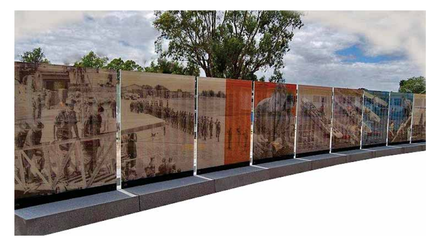
Above - Part of the Vietnam Veterans Memorial Walk Seymour Victoria

All members are invited to attend, especially the Vietnam veteran members of the Association.