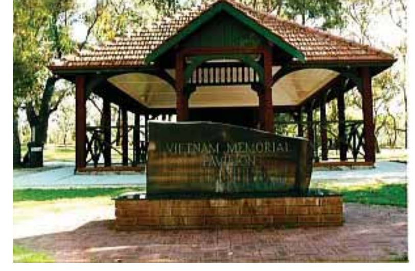
Right - The Vietnam Memorial Pavilion Kings Park.