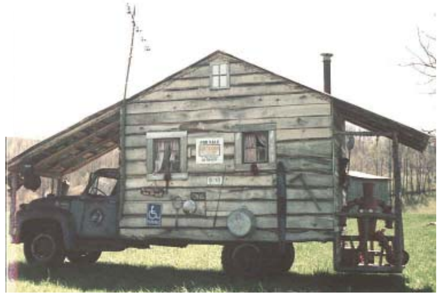
RAEME Workshop in the Paddock - what we'd like to see!

If you have low self esteem. Please hang up. All our operators are too busy to talk to you.