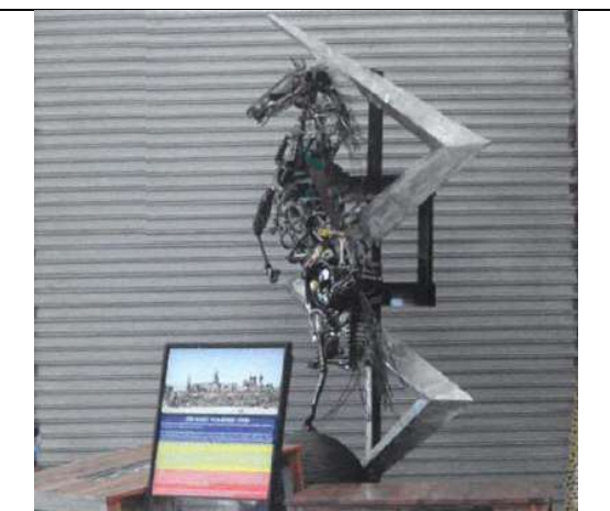
'Harry' taking pride of place in SASR WKSP for the 75th RAEME Birthday celebrations

The WA 75th RAEME Birthday celebrations were held at Campbel Barracks, Swanbourne and involved serving ARA and ARes RAEME members from Pilbara Regt, 13CSSB (Ind SASR. Members of JLU(W) were asked to be judges for the days events and kicked off with a kart build/race challenge a 3 man team from each unit had 1 hr to build a kart from supplied components followed by a two lap race around a deSignated track which included a driver change. Not much skin was lost (nothing that the risk assessment didn't highlight) with winning unit of the kart challenge being SASR by a fair margin.