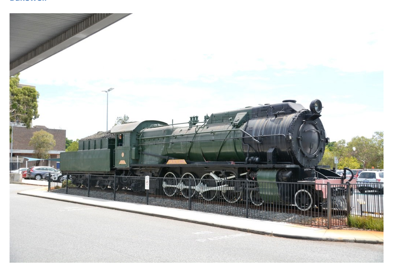
Bakewell, (S542) is an S Class steam locomotive which was constructed in 1943 and is preserved in East Perth at on the site of the old East Perth Locomotive Depot