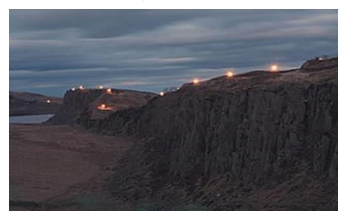
While on the subject of Hadrian's Wall

There are a few people in this Association who were supposedly posted there as Tech Spt.