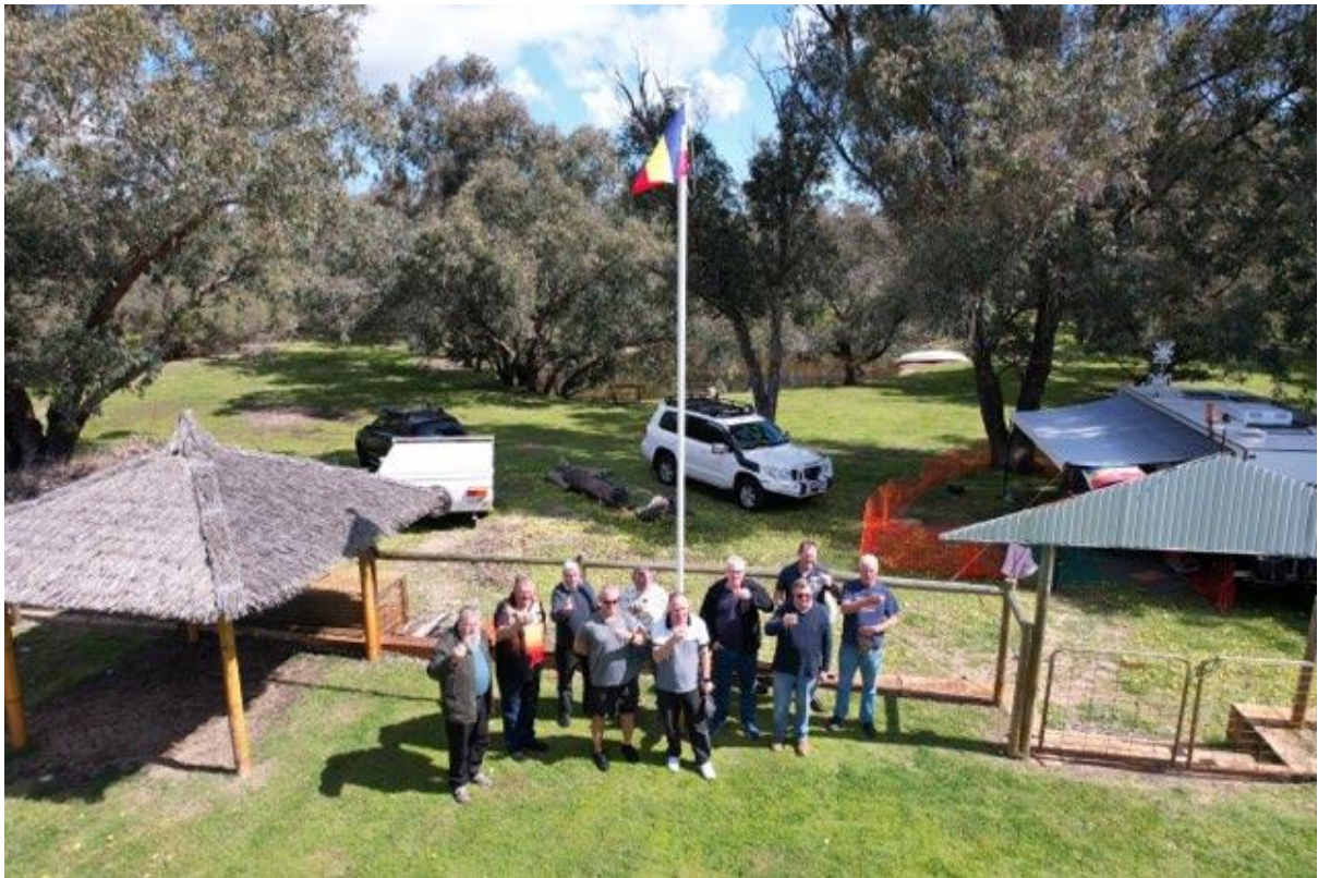
And off to the Waroona for the All Australian Car Day and Vintage Machinery Rally