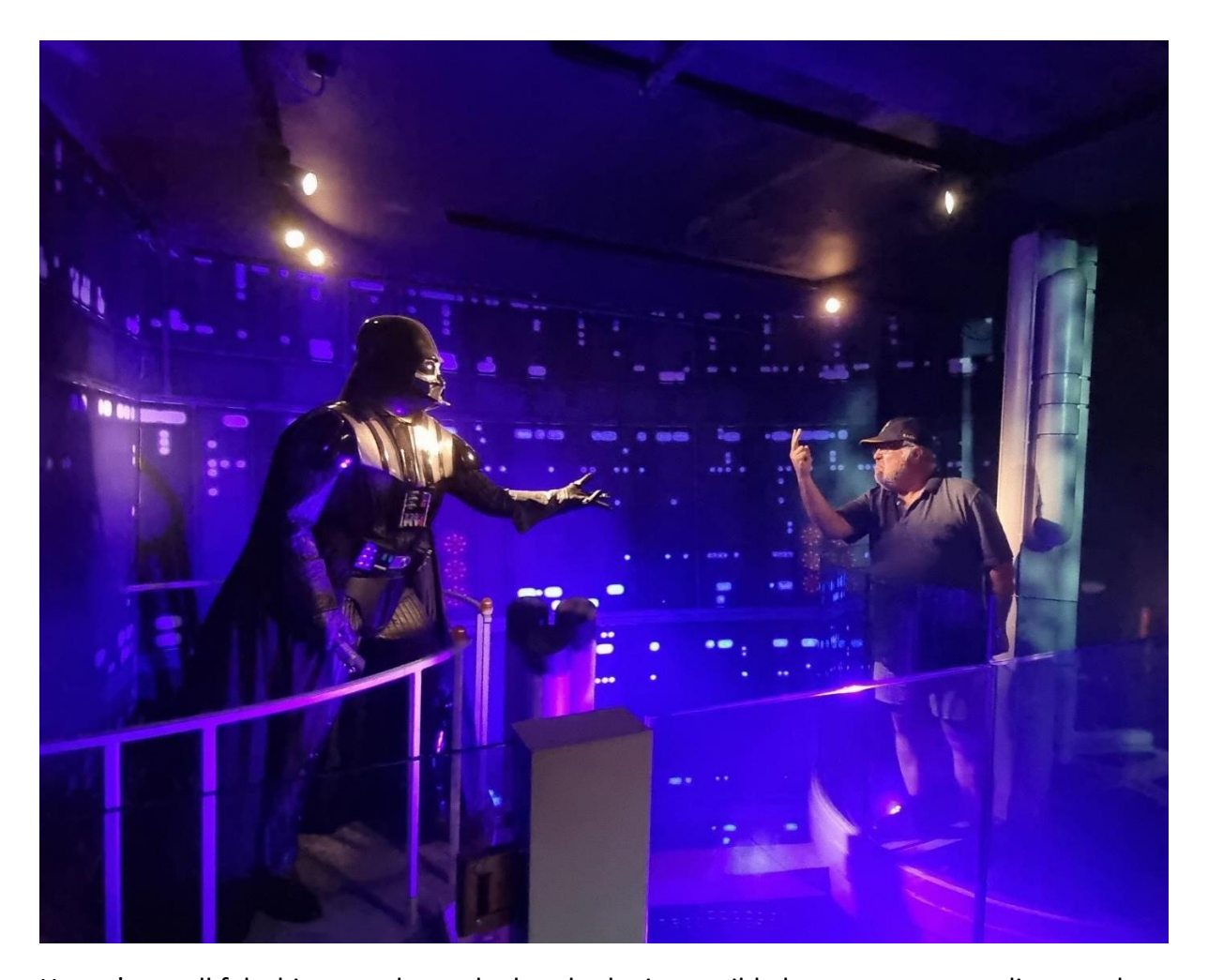
Haven't we all felt this way when asked to do the impossible by an arms corps client, and then doing it regardless?